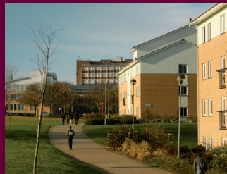
HARROW HALL, HARROW-ON-THE-HILL