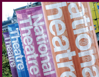
INTERNATIONAL HOUSE, SOUTHBANK