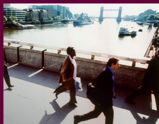
MARYLEBONE HALL, BAKER STREET