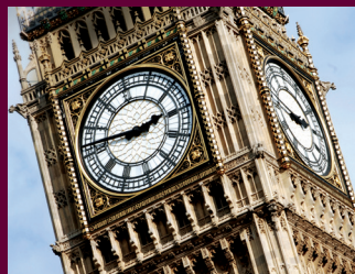
WIGRAM HOUSE, WESTMINSTER